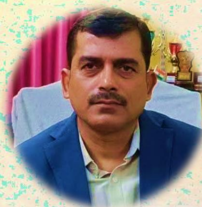
Chairman and Convenor